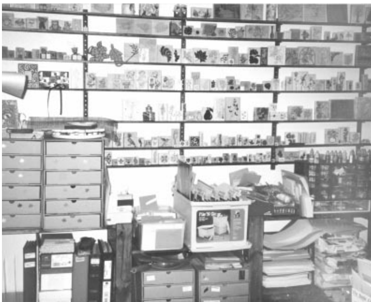
East Wall showing storage of rubber stamps and paper storage.

I have got to have a little disarray or my room wouldn't be the room of an Artist!