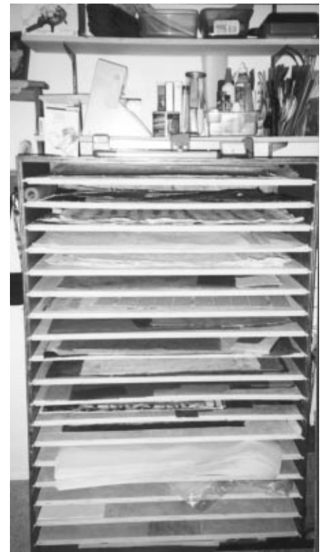
Paper Cabinet/Drying Rack (South Wall)