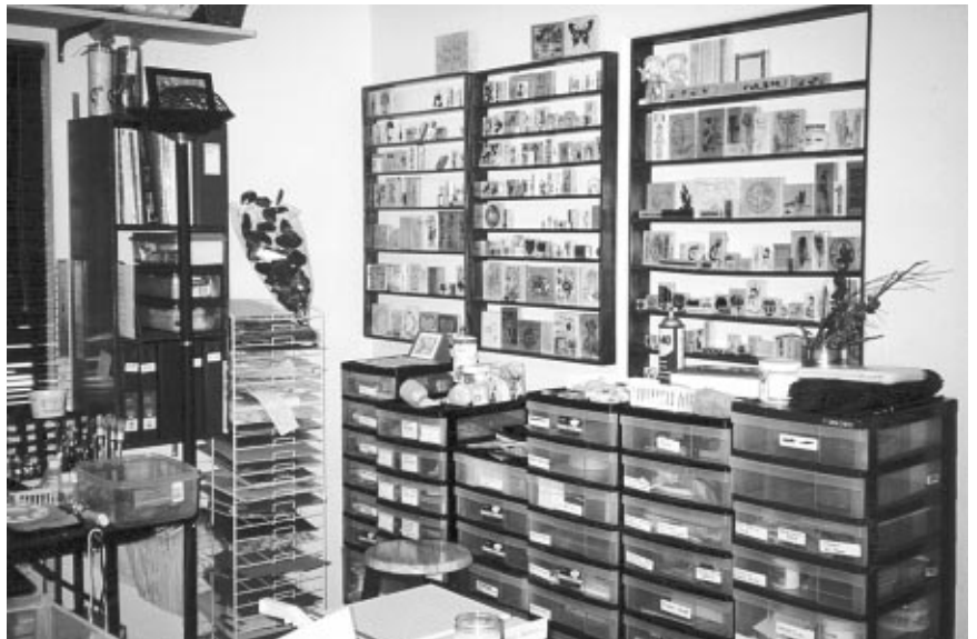
West & North walls showing rollaway drawers, vertical book shelf and display (storage) of rubber stamps on the wall.